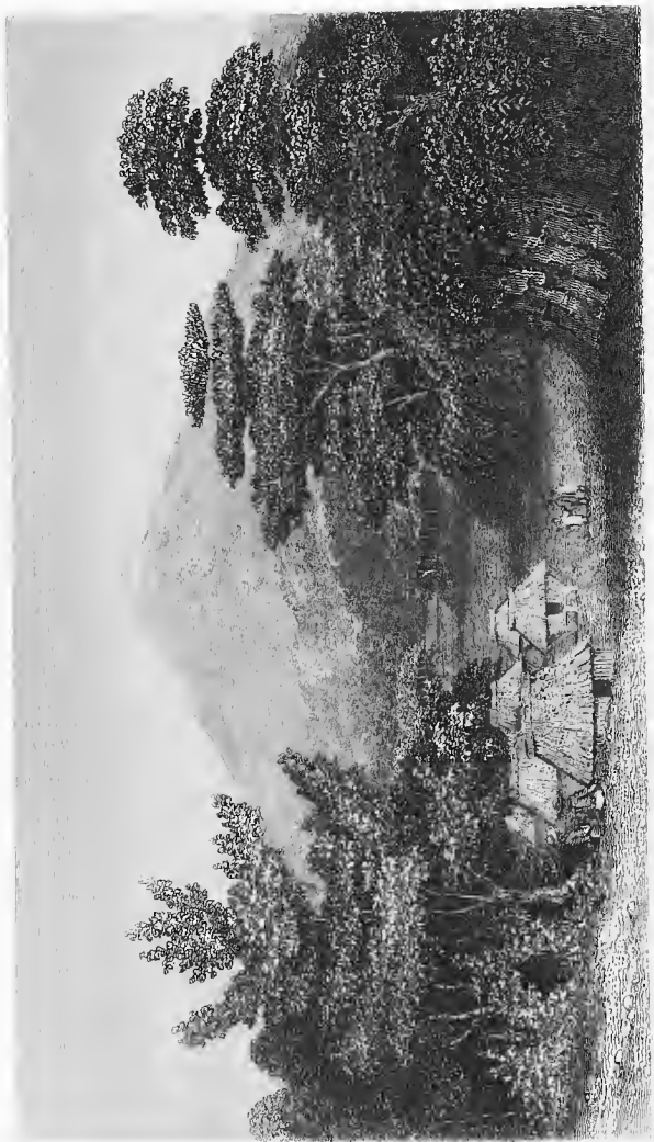
The Valley of Wanda, in A. S. C.